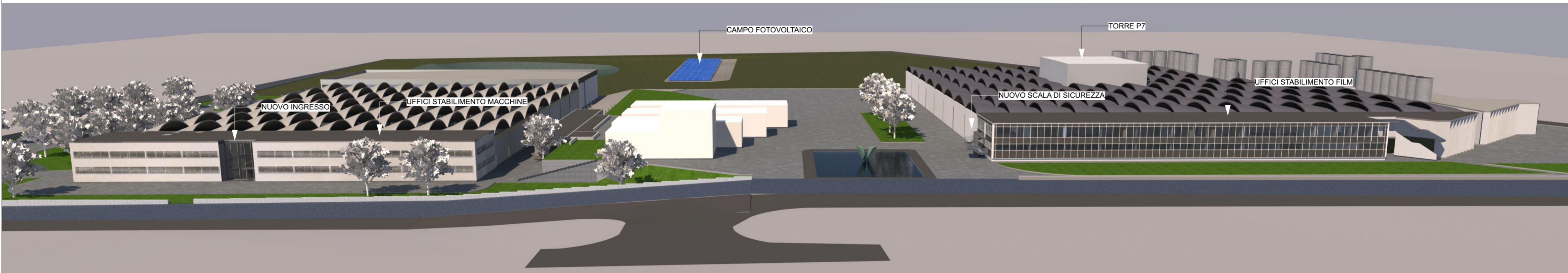
VISTA PLANIMETRICA INTERO STABILIMENTO